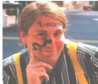
Public Relations for